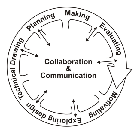
Figure 3. A model of D&T education centred on collaboration and communication.

Ideally, the core of technology education at school level in the Indian context will be design and technology (D&T) activities that use a variety of skills and draw upon the knowledge of key concepts traditionally taught within other disciplines. The activities would integrate aspects of affect (wants, desires, and aesthetics) and judgements (making strategic alliances, choosing materials, and evaluating products). They will go beyond episteme (knowledge) and techné (skill), and include phronesis (practical wisdom) (Dunne, 1993). The hallmarks of technological empowerment will include the ability to design, innovate, make, evaluate, and communicate the technological goals, processes, and products through collaboration within a complex sociocultural environment as indicated in the model in Figure 3 (Choksi, Chunawala and Natarajan, 2006). A stage-wise curricular framework for a collaborative and communication-centred D&T education has also been developed at HBCSE.